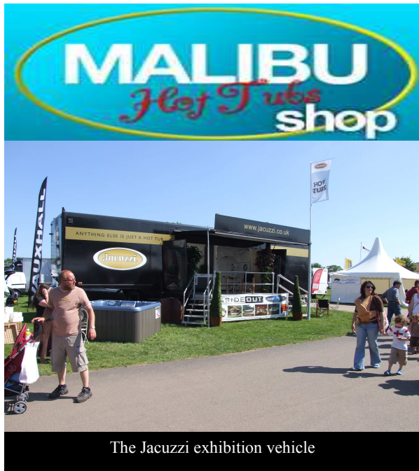
The Jacuzzi exhibition vehicle

Malibu Hot Tubs have just returned from a successful County Show. The Jacuzzi exhibition vehicle attracted a large number of visitors over the two day event which took place on Wednesday 2 and Thursday 3 June, with plenty of quality leads taken for hot tubs, swimming pools, swim spas and thatched roofed garden buildings. Now all that is needed is to convert the keen interest into sales!"