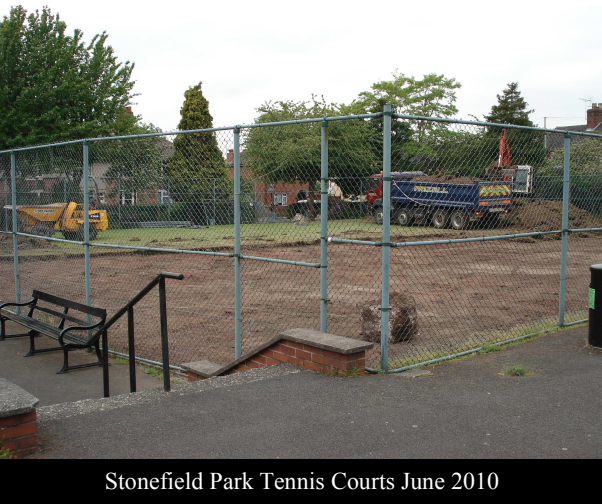
Stonefield Park Tennis Courts June 2010

In theory the work is scheduled to take five weeks at the end of which the