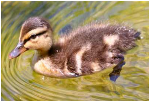
One of many ducklings wondering what the fuss is all about

“It’s not everyday you get a phone call asking if you know anything about ducks!”