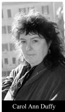
Carol Ann Duffy