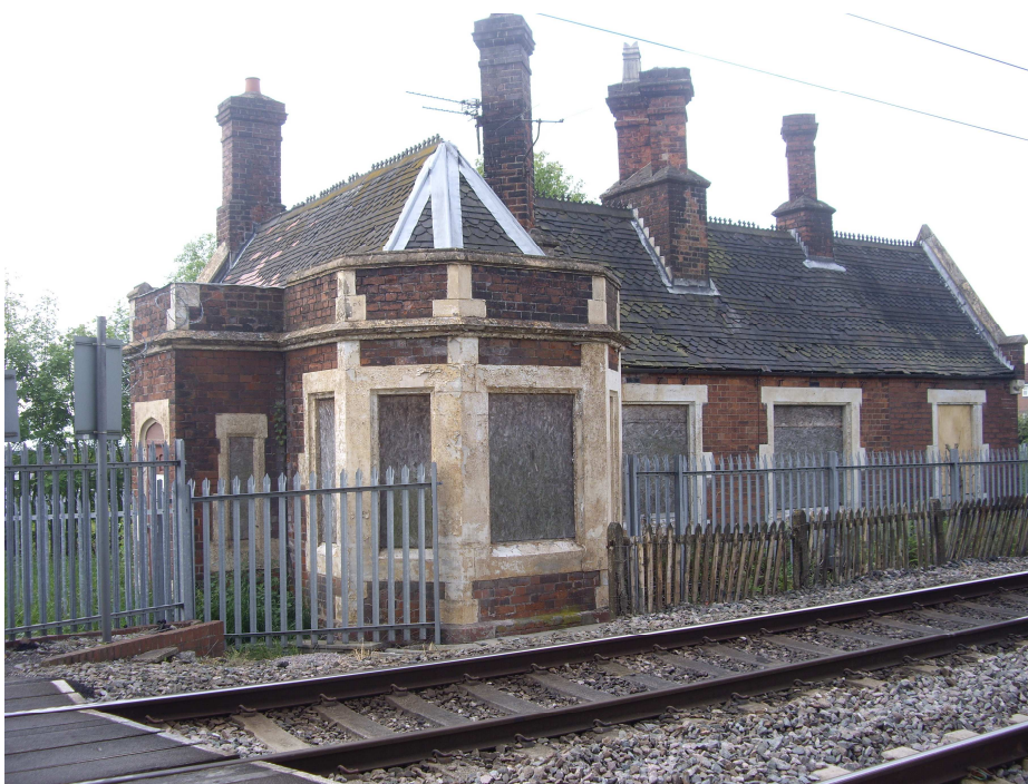
The Crossing Keepers Cottage—soon to be 'on the move'

Funding for the move of the cottage to Cheddleton has now been secured and the site at Cheddleton Station has been cleared in preparation for the building imminent arrival. Stafford Borough Council have granted permission for the building to be relocated and it is now just a matter of waiting for Staffordshire Moorlands District Council to approve the changes needed to comply with disability requirements before the building will be on