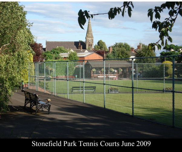
Stonefield Park Tennis Courts June 2009

Many of you may have been following the campaign to save the grass tennis courts at Stonefield Park, the local park situated just the other side of the railway line in Stonefield Square. Last summer we reported that Stafford Borough Council were planning to rip up the grass tennis courts to make way for a tarmac playing surface.