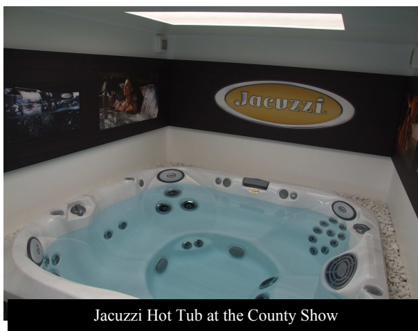
Jacuzzi Hot Tub at the County Show