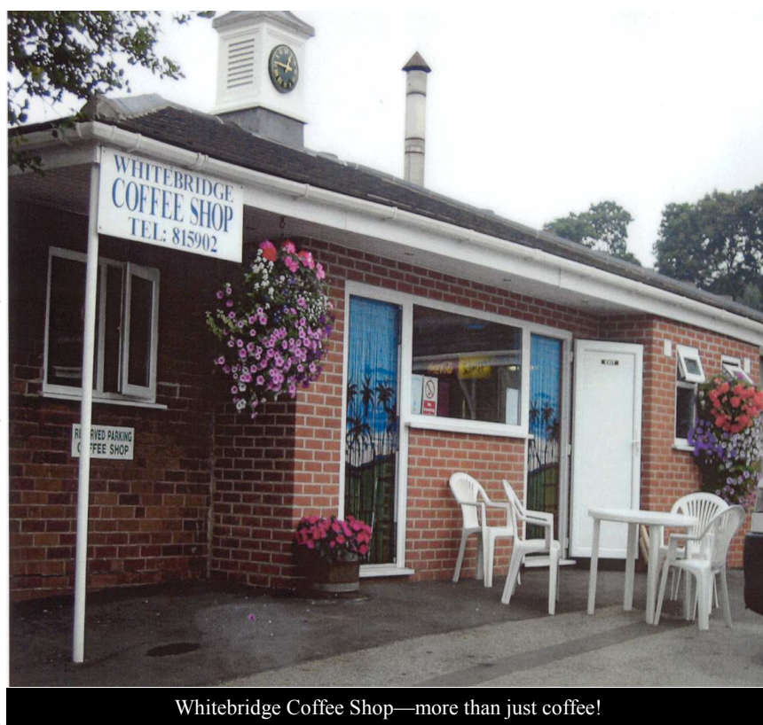
Whitebridge Coffee Shop—more than just coffee!

If you would like more information regarding our services please don't hesitate to get in touch on 01785 815902.