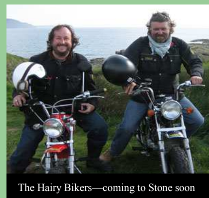
The Hairy Bikers—coming to Stone soon

The programme is still to be finalised but the highlight is bound to be the appearance of the Hairy Bikers on Sunday. For further details go to the Festival website at www.stonefooddrink.org .