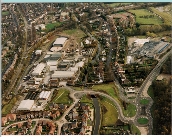
dergoing road works and also the amount of traffic that the Estate now creates.

If my memory serves me right it was around 1996 that Colonel started the procedure to build new Commercial Units on the top road, which is now called Whitebridge Way. Part of the new development included a new road system to bring traffic off the A34 onto the new housing estate and Whitebridge Estate. A great many of us were thrilled at this prospect, because the only road into and out of the Estate at that time was over a hump back bridge off Newcastle Road which was a pretty scary event when we were faced with artic lorries. Not sure what we would have done if this was still the case, with Newcastle Road currently being closed in one direction on a temporary basis whilst un-